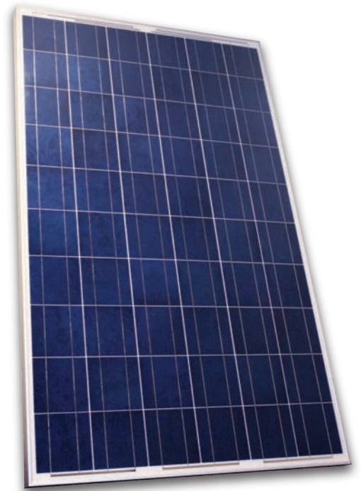
POLY-CRYSTALLINE SOLAR MODULE